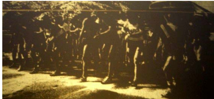
Runners set to start the AOH St. Pat's 6 mile.