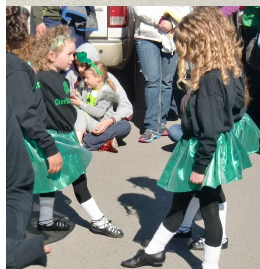
... and some Irish dance.