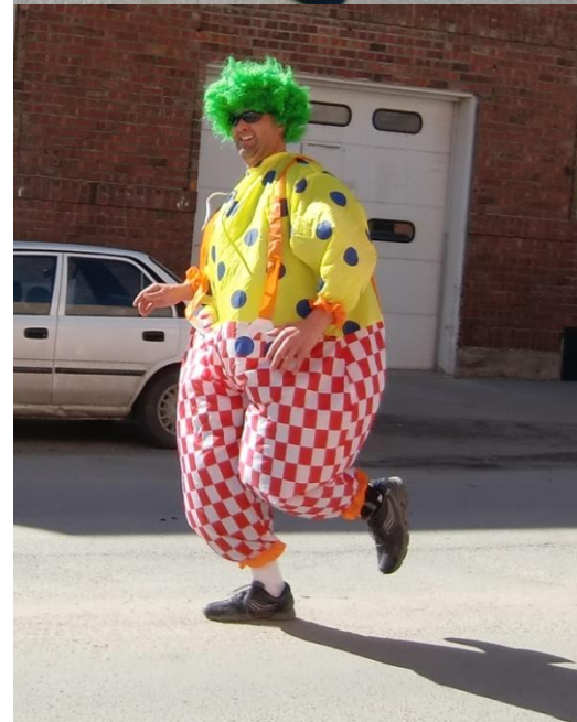
There was some clowning...