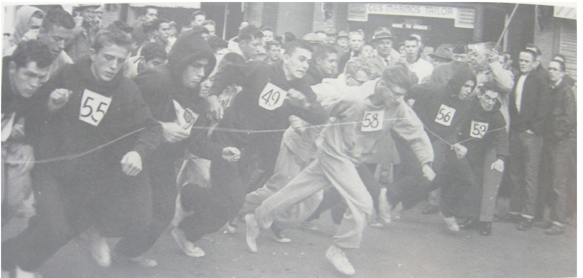
Right: The starter fires his rifle in the background, unleashing a mad scramble of sneakers and sweat suits.

A Bulldog and a Maroon running in step across the brick-laid street surface.