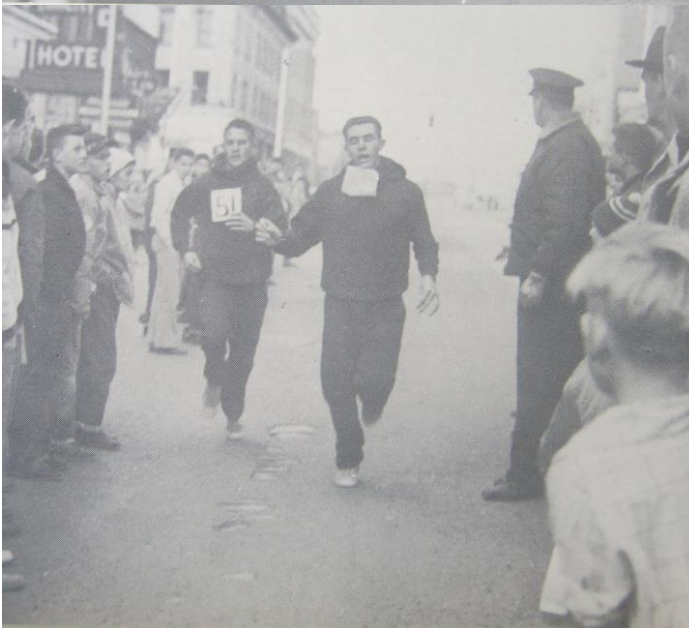
Two Maroons find their way through the crowded onlookers, as they race toward the finish line.