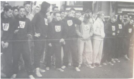
Above: 'The calm before the storm.'

Team Scores: Butte High, 13; Butte Central, 8.