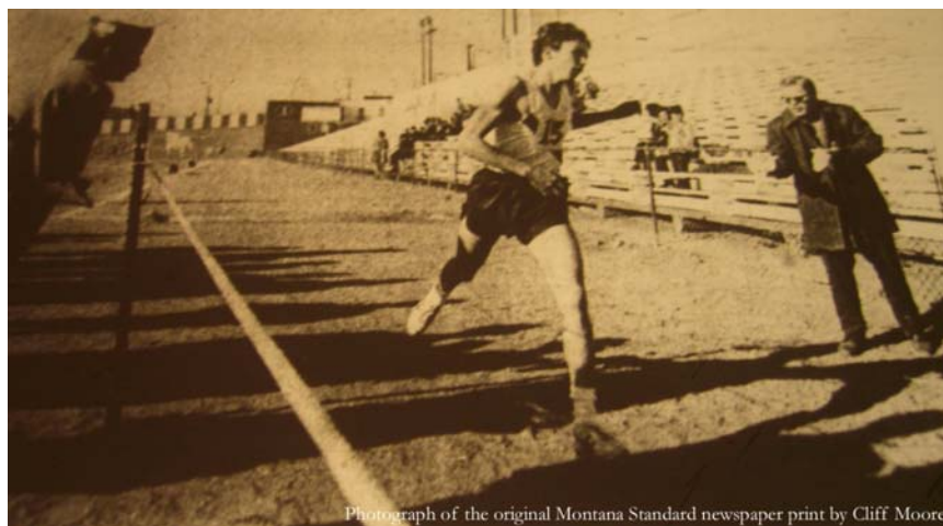
Photograph of the original Montana Standard newspaper print