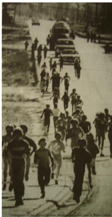
Photograph of the original Montana Standard newspaper print by Walter Hinck

Runners line Continental Drive during the 2.5 mile run.